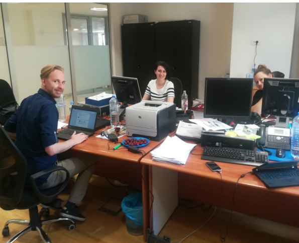
Working on upgrading salary / personnel IT system of the Budget and Funds Department

Some changes for the monthly data (F1 template) were made into Access application e.g. for better harmonization with new legislation and MISA job-titles. Furthermore, for faster estimations and projections and to ease the monitoring of the budget, experts built a new annual Access that gathers every month salaries from monthly salary Access applications and produces new reports and some estimation straight from the data it contains. The use of individual level monthly correction data was also tested. However, to get the new annual Access into use, the BFD must start to gather the monthly correction data from the budget users at the individual level with the F1 form. And in order to get the new changes of F1 (incl. MISA job codes) into use, the BFD must implement the new F1 form into full use. A preliminary pilot budget user meeting to discuss e.g. these topics took place 05 June, but more cooperation is needed. The experts recommend that the new Access application would be taken immediately into use and the new F1 format would be taken into use in October.